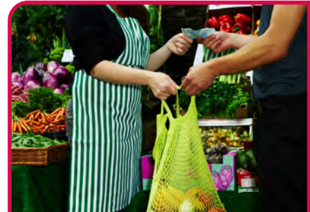
People use money to pay for things they want and need.