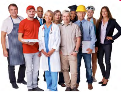
There are lots of different jobs people do.