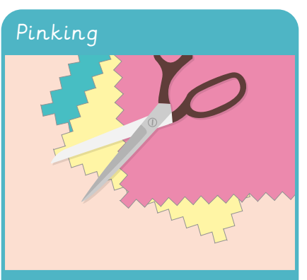
To use pinking shears to cut a zig-zag or scalloped decorative edge.