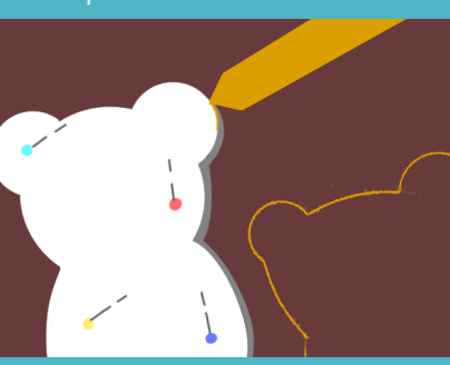
A stencil made used to make many copies of a shape or help cut material accurately (e.g. biscuit cutter).