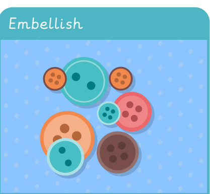
Add decorative details or features to something. For example, to add sequins, buttons or beads.