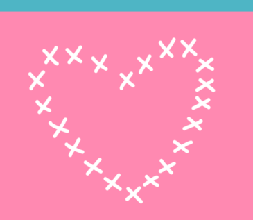
A two-stitch style of sewing that forms a cross pattern. Used to add decorative features to fabric.