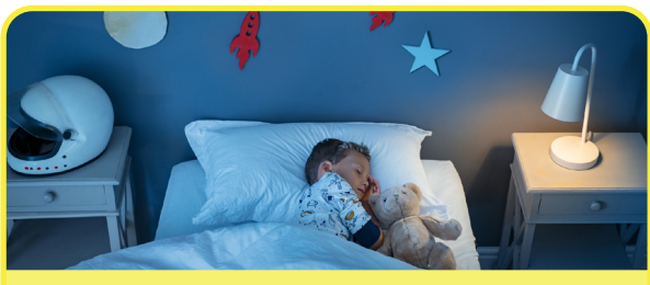
Establish good habits for sleeping.