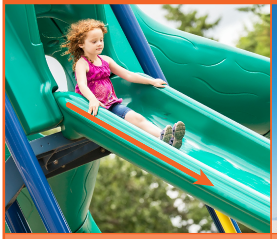
Linear motion Movement in a straight line in any one direction.