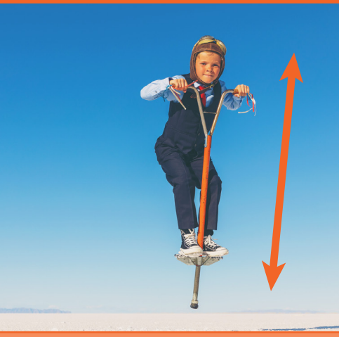
Reciprocating motion Movement in a straight line, back and forth, in any direction.