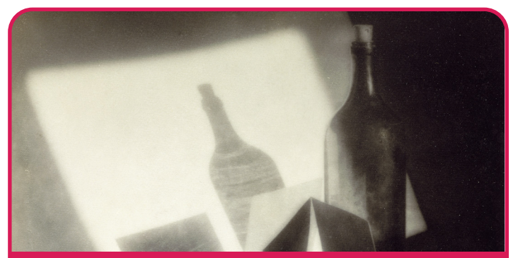
Jaromir Funke A leading photographer from Czechoslovakia during the 1920s and 1930s.